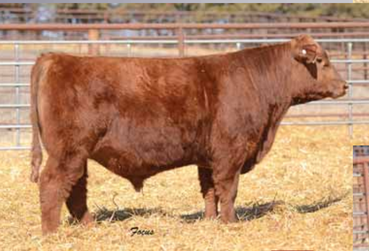
LOT 15 J6 RED HAWK D663