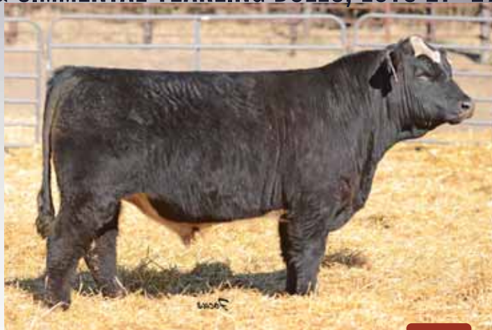
LOT 21 J6RA HAMMER THIS D906