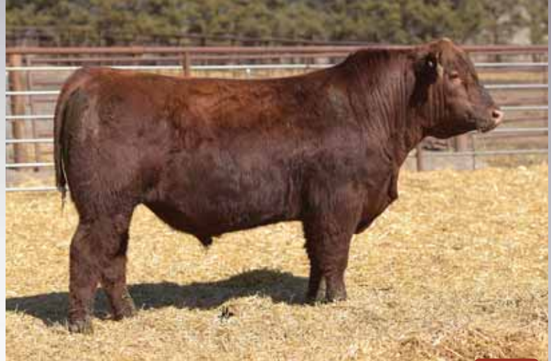
LOT 4 MAJESTIC LIONHEART C46

CED BW WW YW MILK ME HPG CEM STAY MARB YG CW REA FAT 2 0.5 60 90 18 3 10 4 8 0.22 0.06 25 -0.04 -0.01