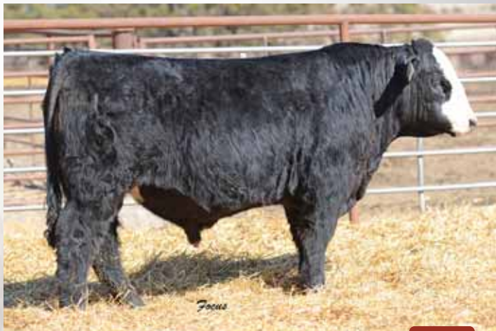
LOT 22 J6RA HAMMER ALL D907