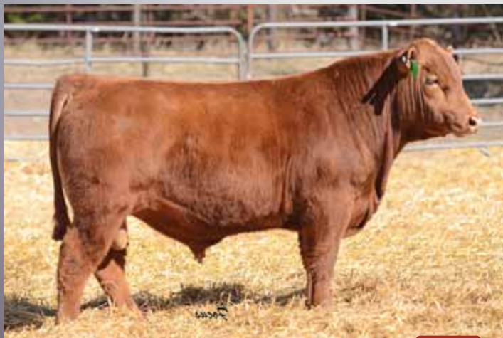
LOT 10 J6 VERDALE C827