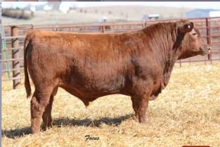
LOT 9 J6 GAME TIME C25