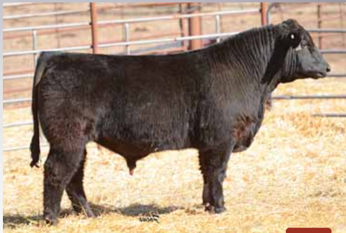
LOT 24 J6RA LEWIS D901