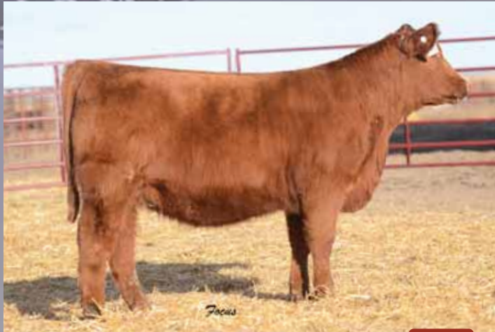
LOT 86 J6 MS. LIGHTNING D322