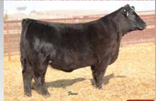
LOT 98 J6RA CONLEY D305