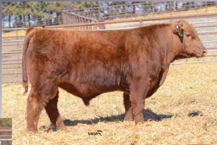
LOT 14 J6 RED ATLANTIC