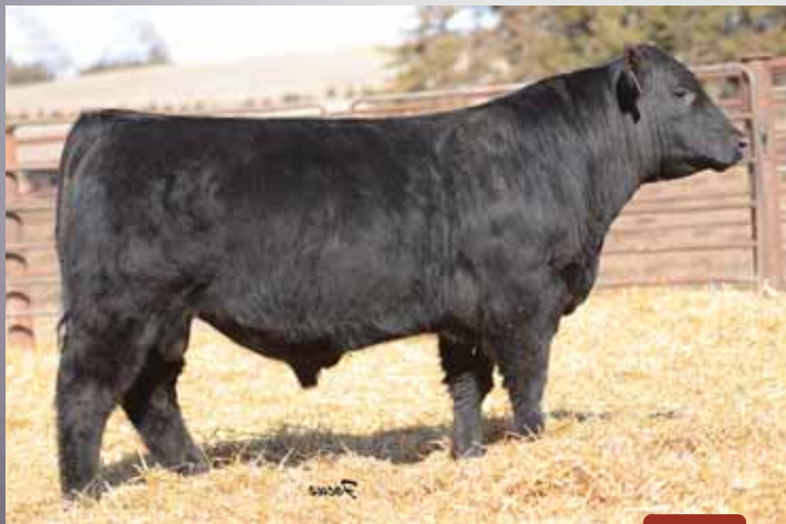
LOT 27 J6RA PHEL'S D902