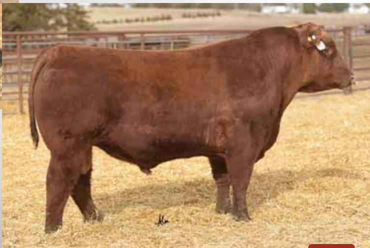
LOT 8 J6 JAKE C556