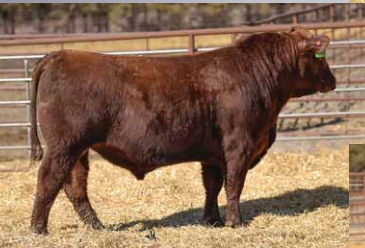
LOT 7 J6 JAKE C585