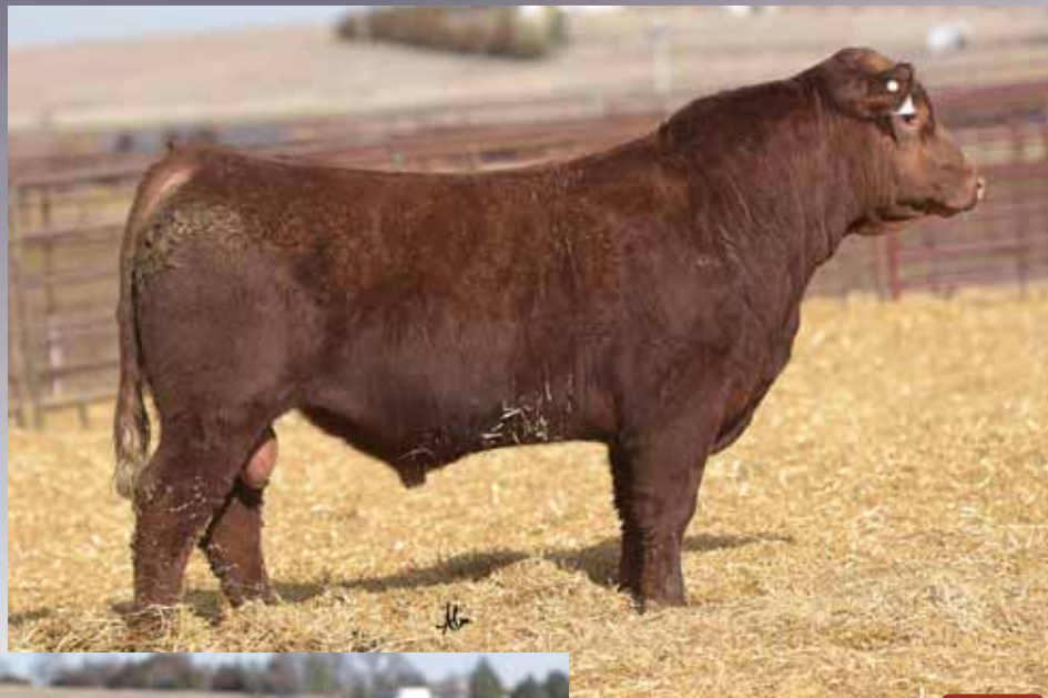
LOT 33 J6RA ROCKIN C256