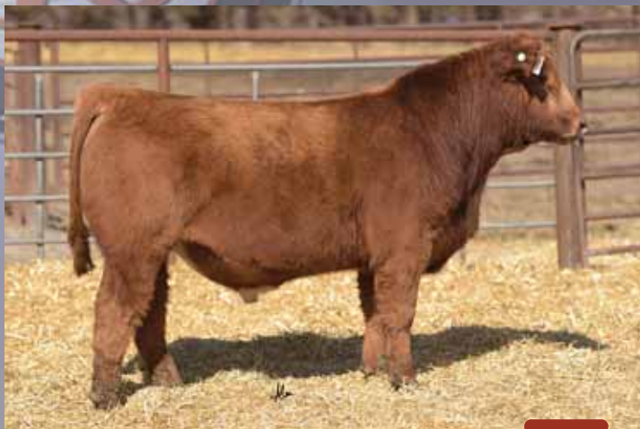
LOT 26 J6RA LEWIS D901