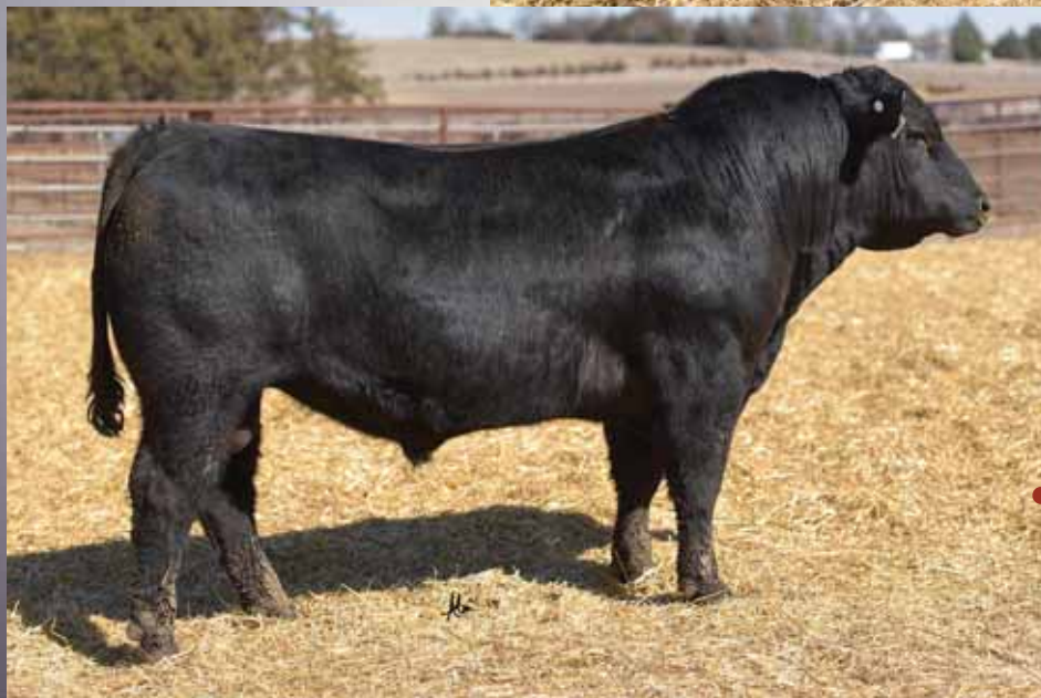
LOT 34 J6RA BLACK ROCK C295