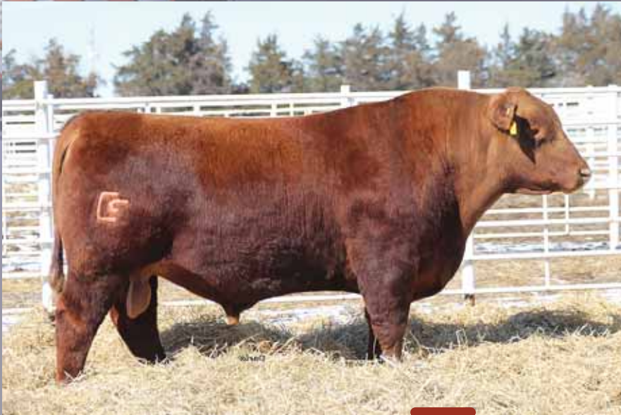
JRA BKE INDEED