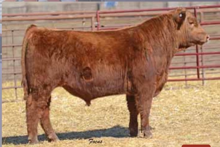
LOT 17 J6 BIG JAG D661