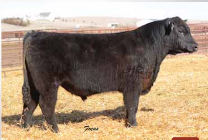
LOT 25 J6RA PHELDS D902