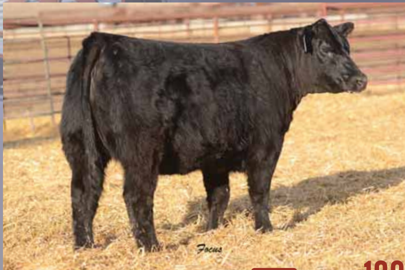
LOT 100 J6RA MAYAH D606