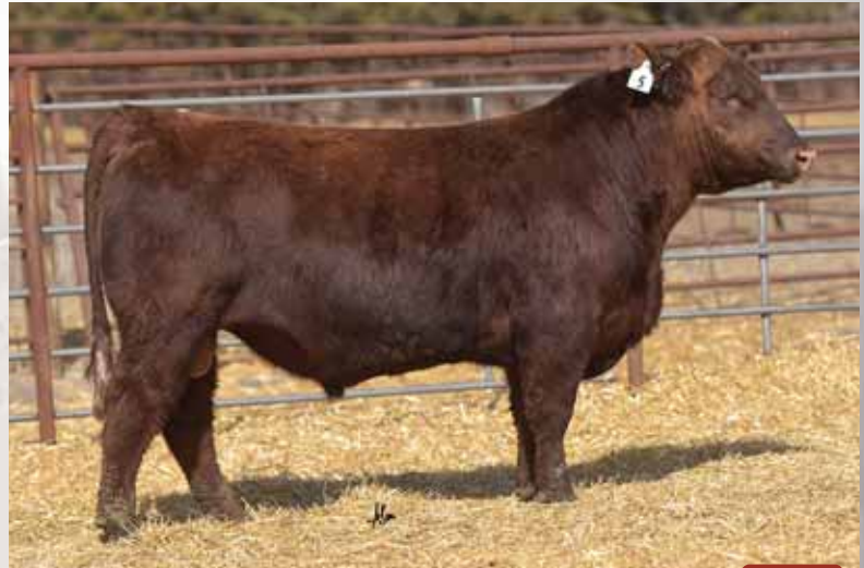
LOT 5 MAJESTIC LIONHEART C47

Adj. BW: 81 lbs. Adj. WW: 600 lbs. Adj. YW: 1,225 lbs.