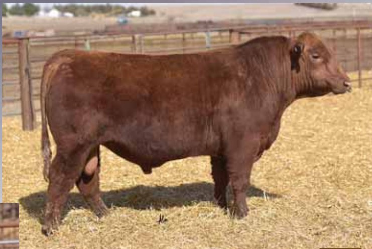
LOT 6 J6 TYLER C561