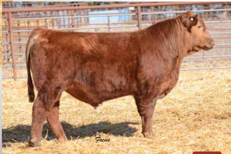
LOT 16 J6 WHOLE HIDE D660