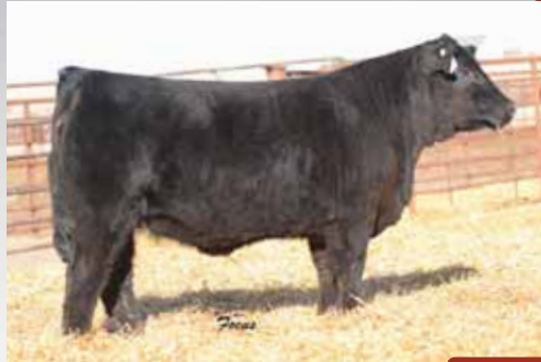
LOT 96 J6RA NIGHTLIFE D137